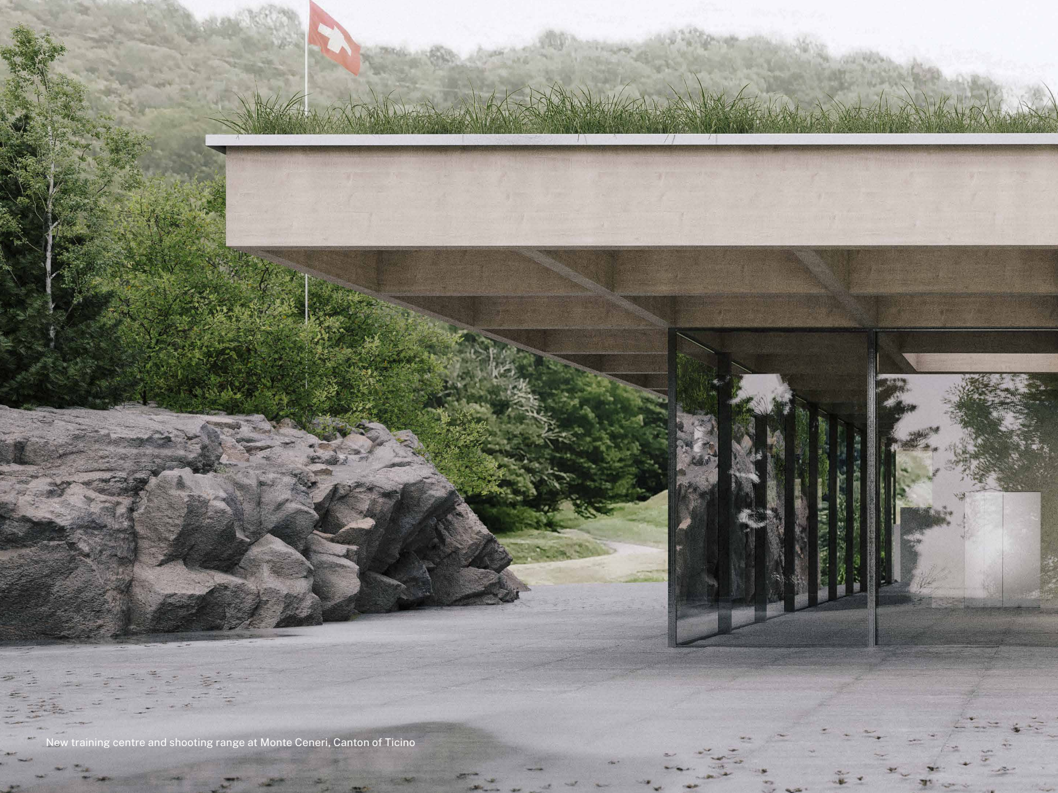
New training centre and shooting range at Monte Ceneri, Canton of Ticino