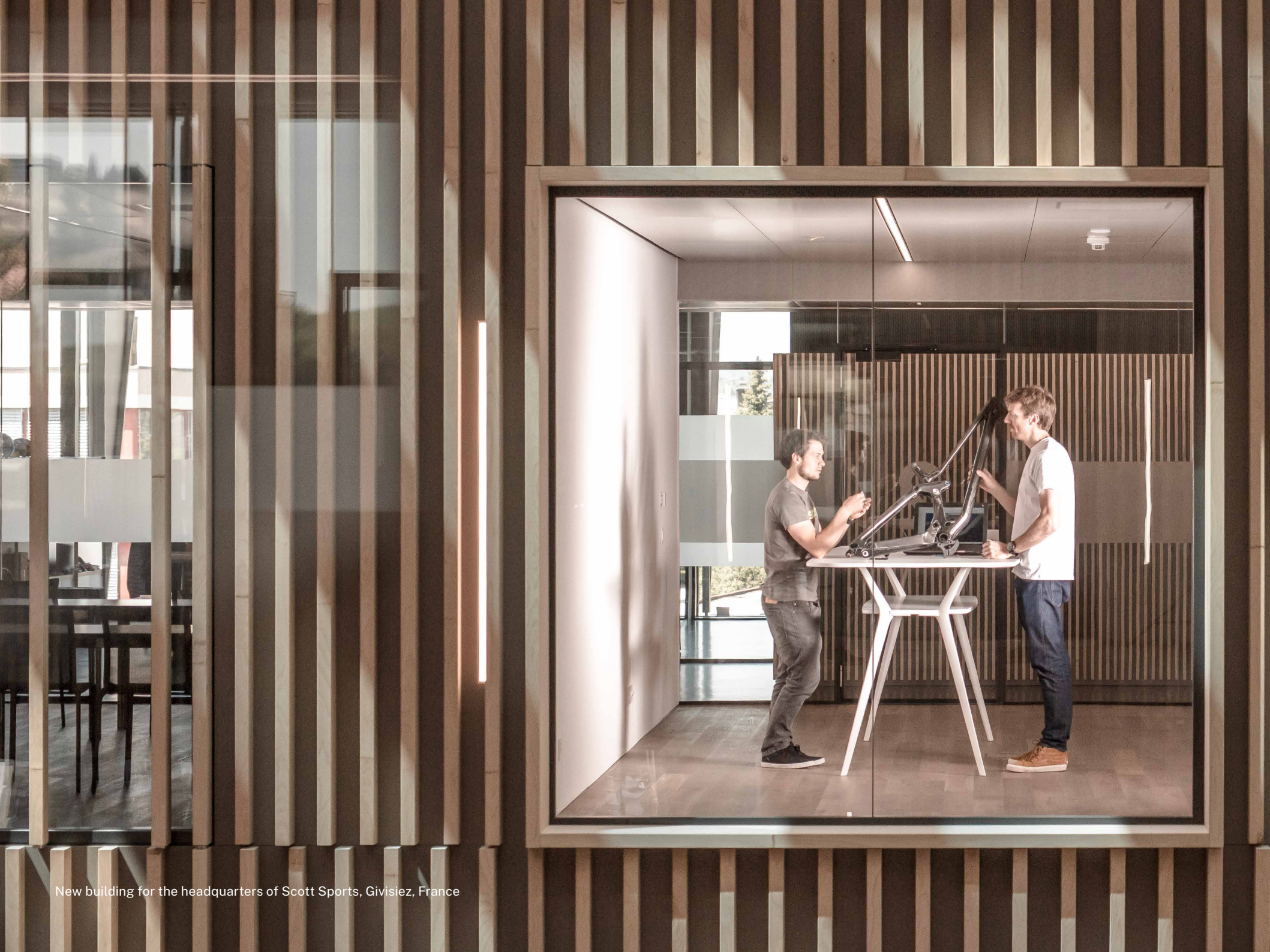
New building for the headquarters of Scott Sports, Givisiez, France