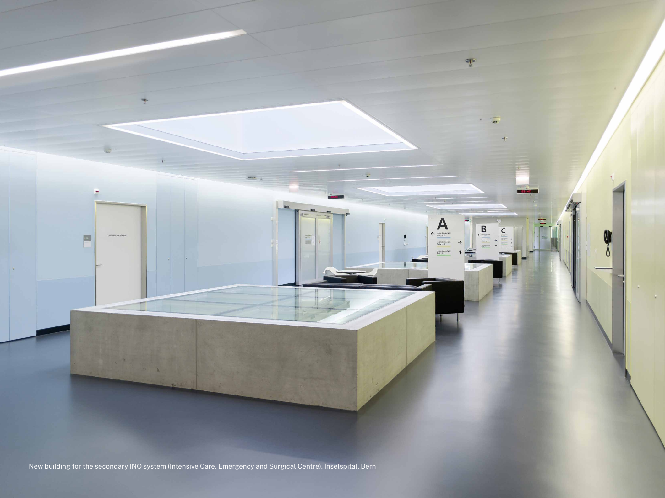
New building for the secondary INO system (Intensive Care, Emergency and Surgical Centre), Inselspital, Bern