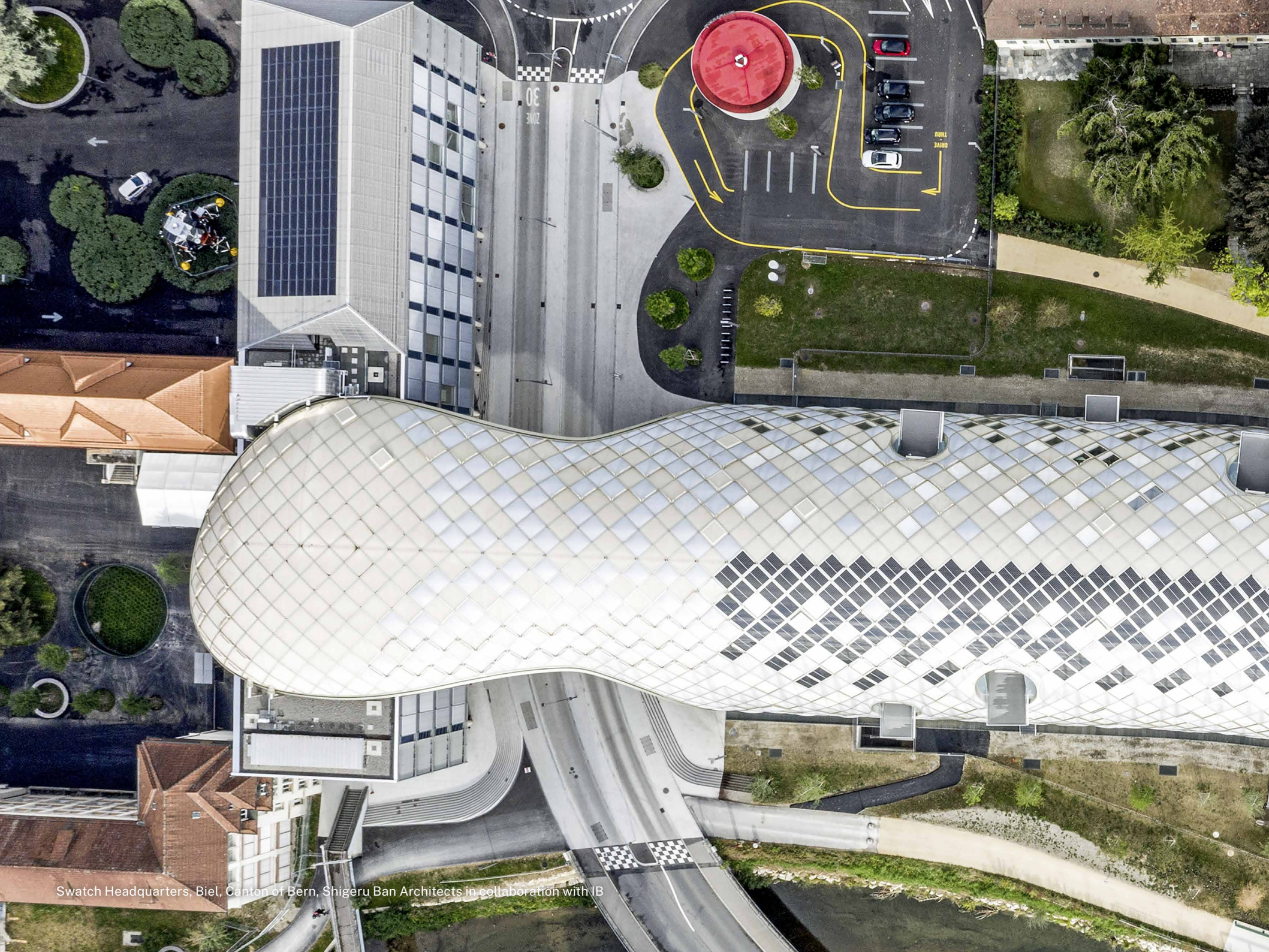
Swatch Headquarters, Biel, Canton of Bern, Shigeru Ban Architects in collaboration with IB