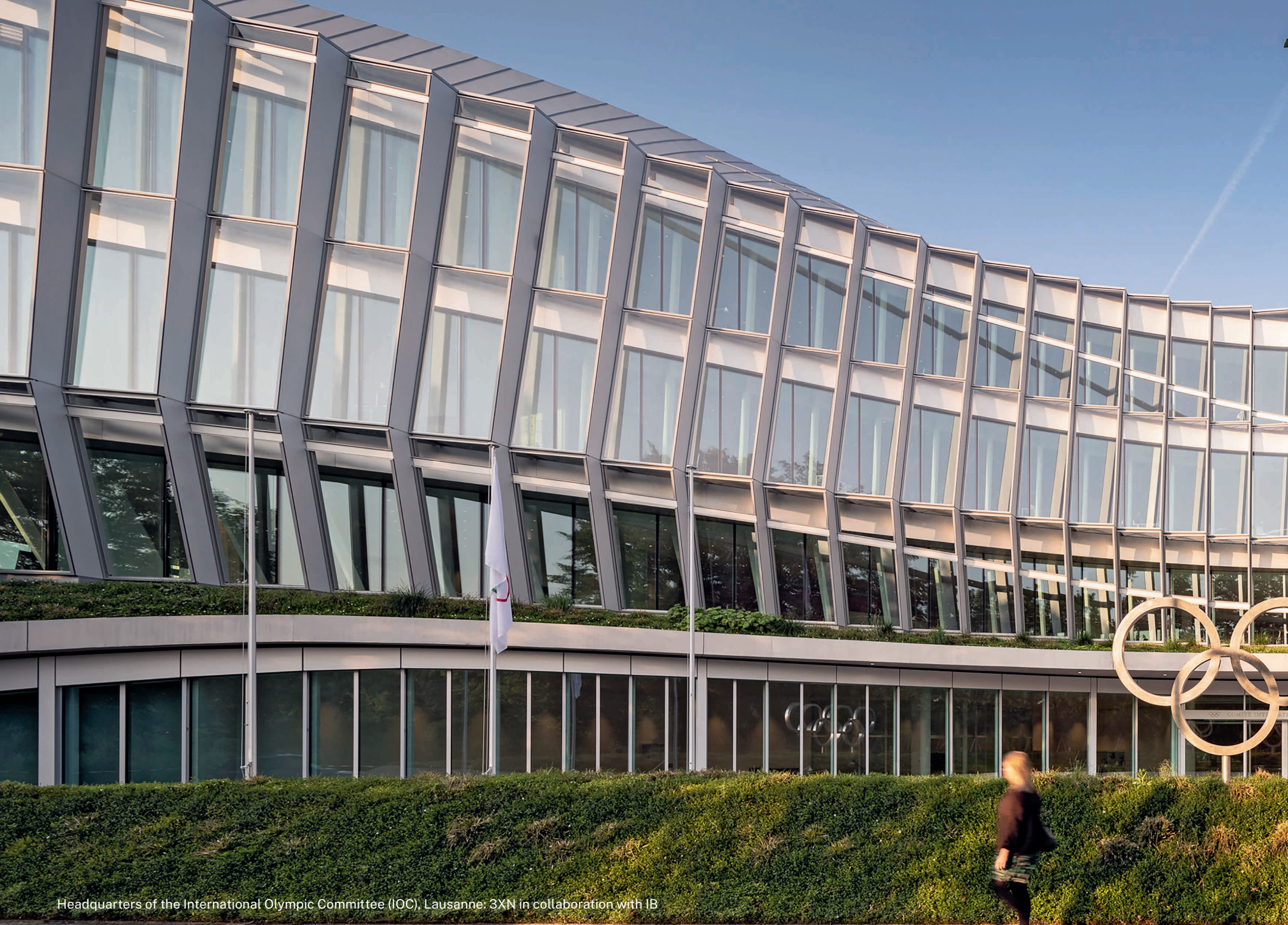
Headquarters of the International Olympic Committee (IOC), Lausanne: 3XN in collaboration with IB