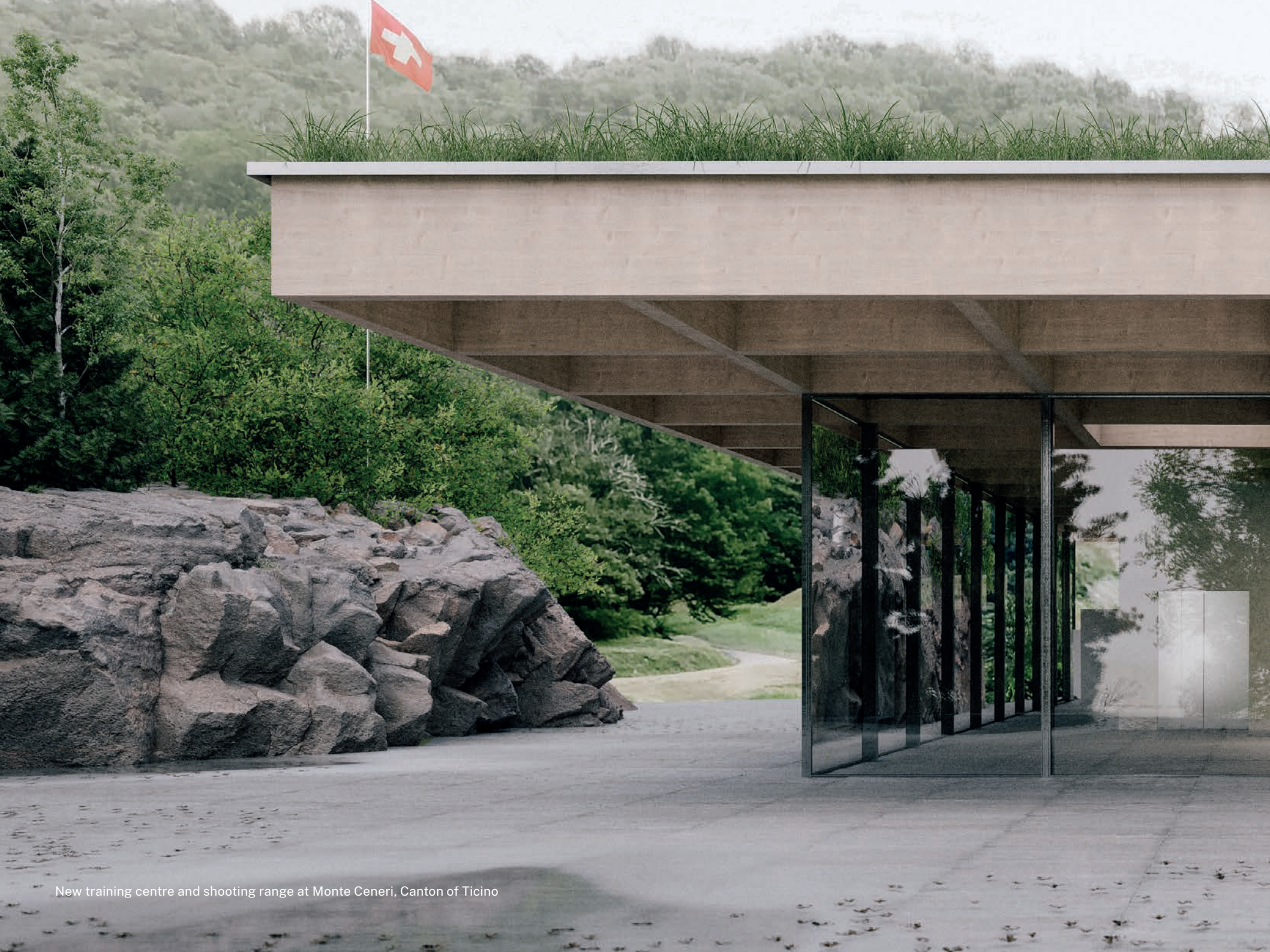
New training centre and shooting range at Monte Ceneri, Canton of Ticino