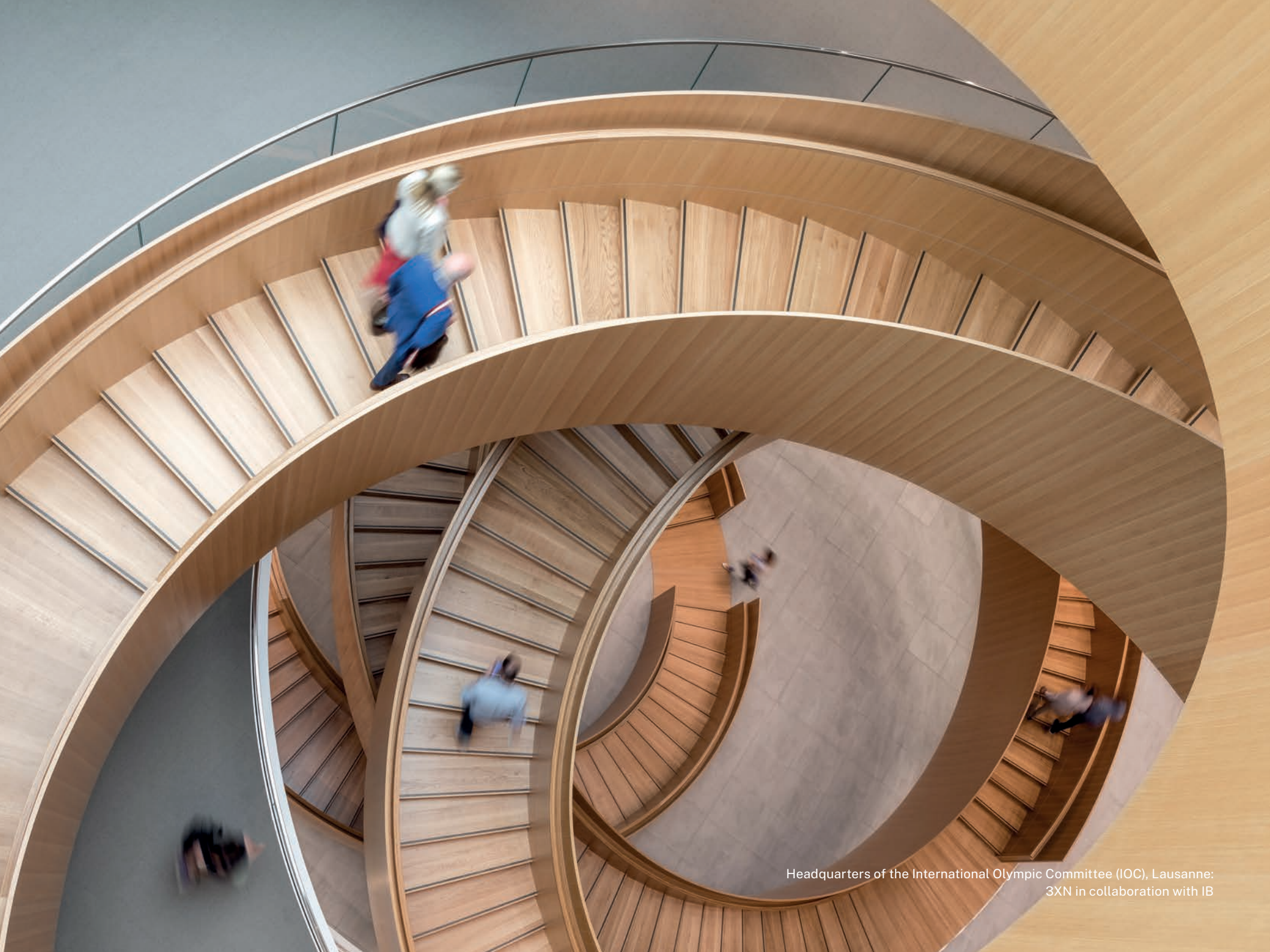
Headquarters of the International Olympic Committee (IOC), Lausanne: 3XN in collaboration with IB