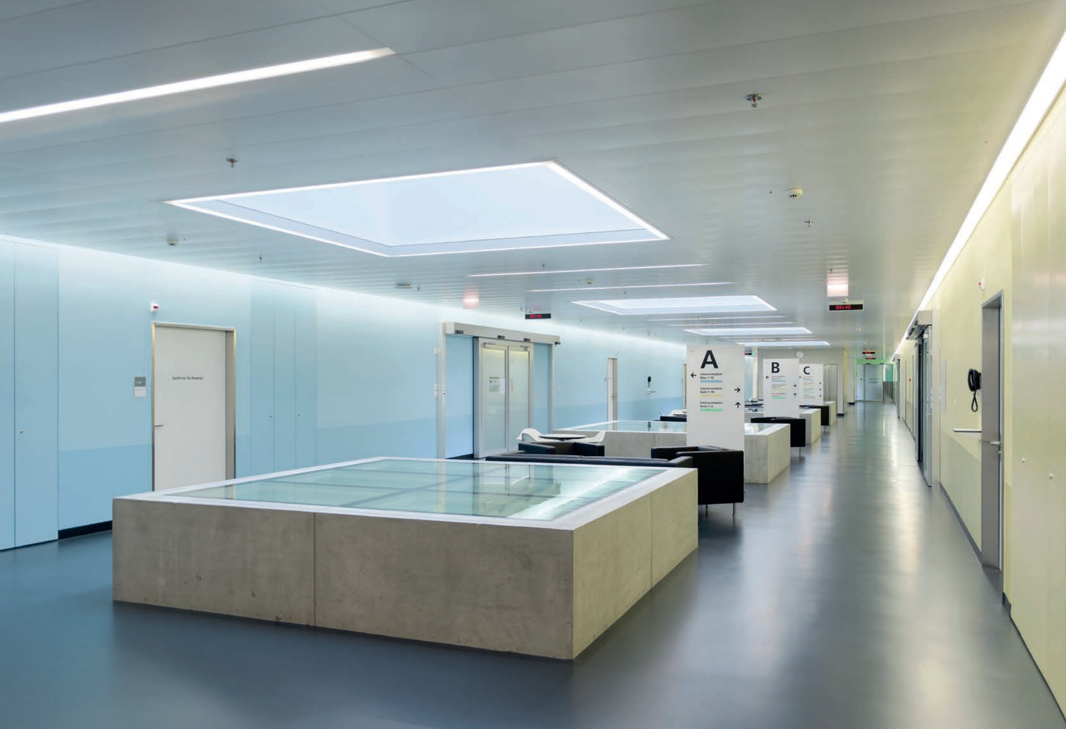
New building for the secondary INO system (Intensive Care, Emergency and Surgical Centre), Inselspital, Bern