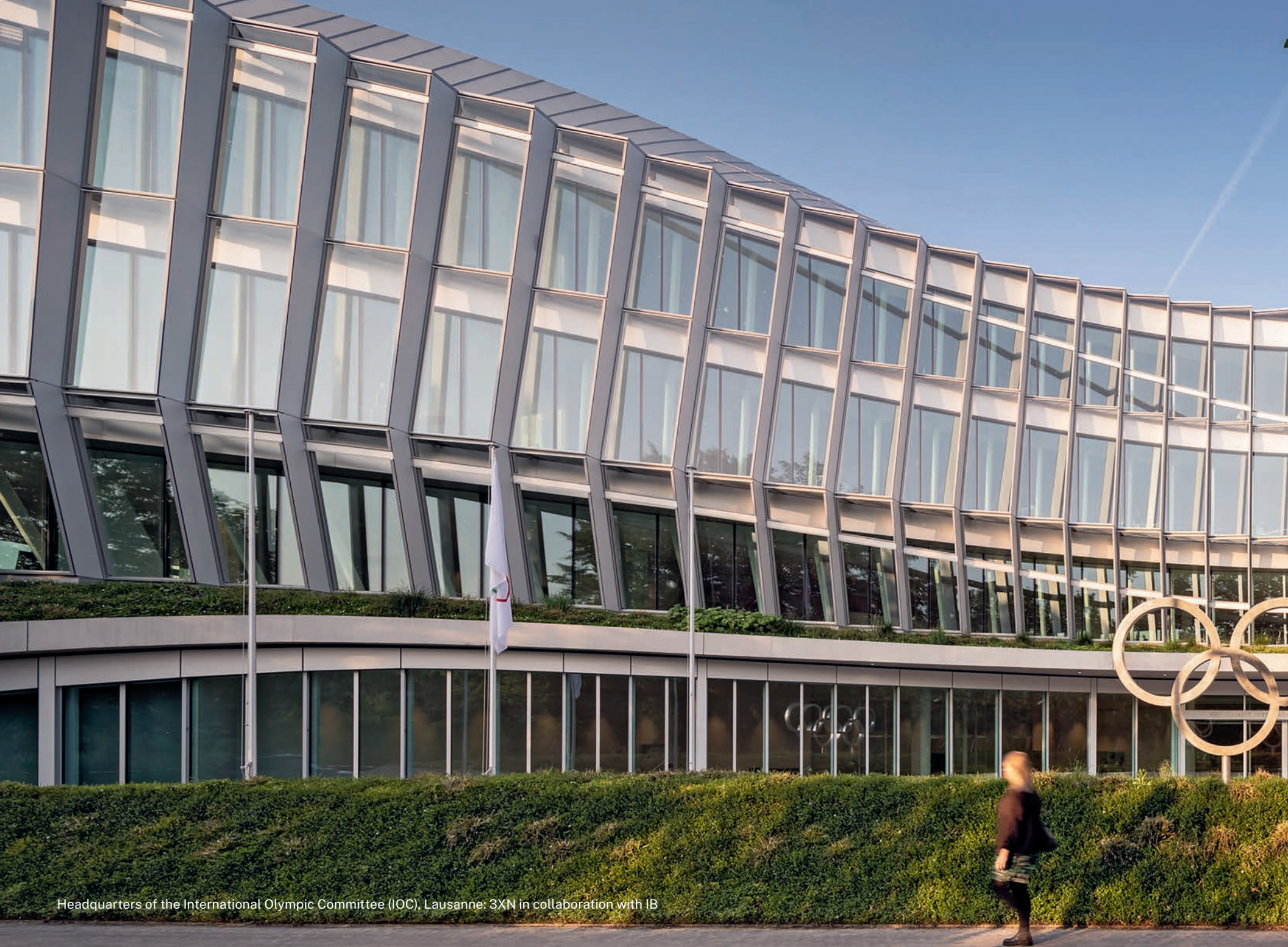
Headquarters of the International Olympic Committee (IOC), Lausanne: 3XN in collaboration with IB