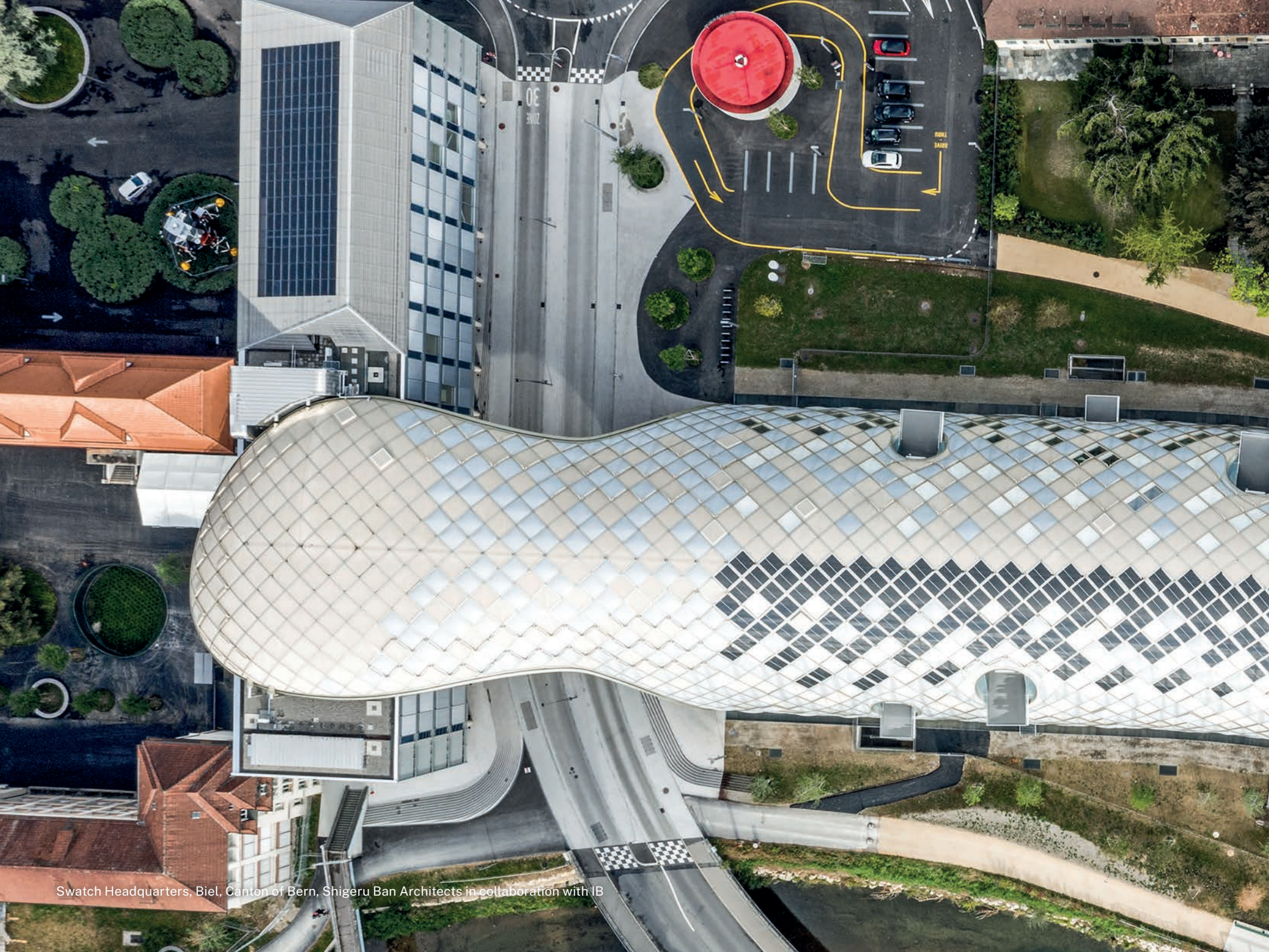
Swatch Headquarters, Biel, Canton of Bern, Shigeru Ban Architects in collaboration with IB