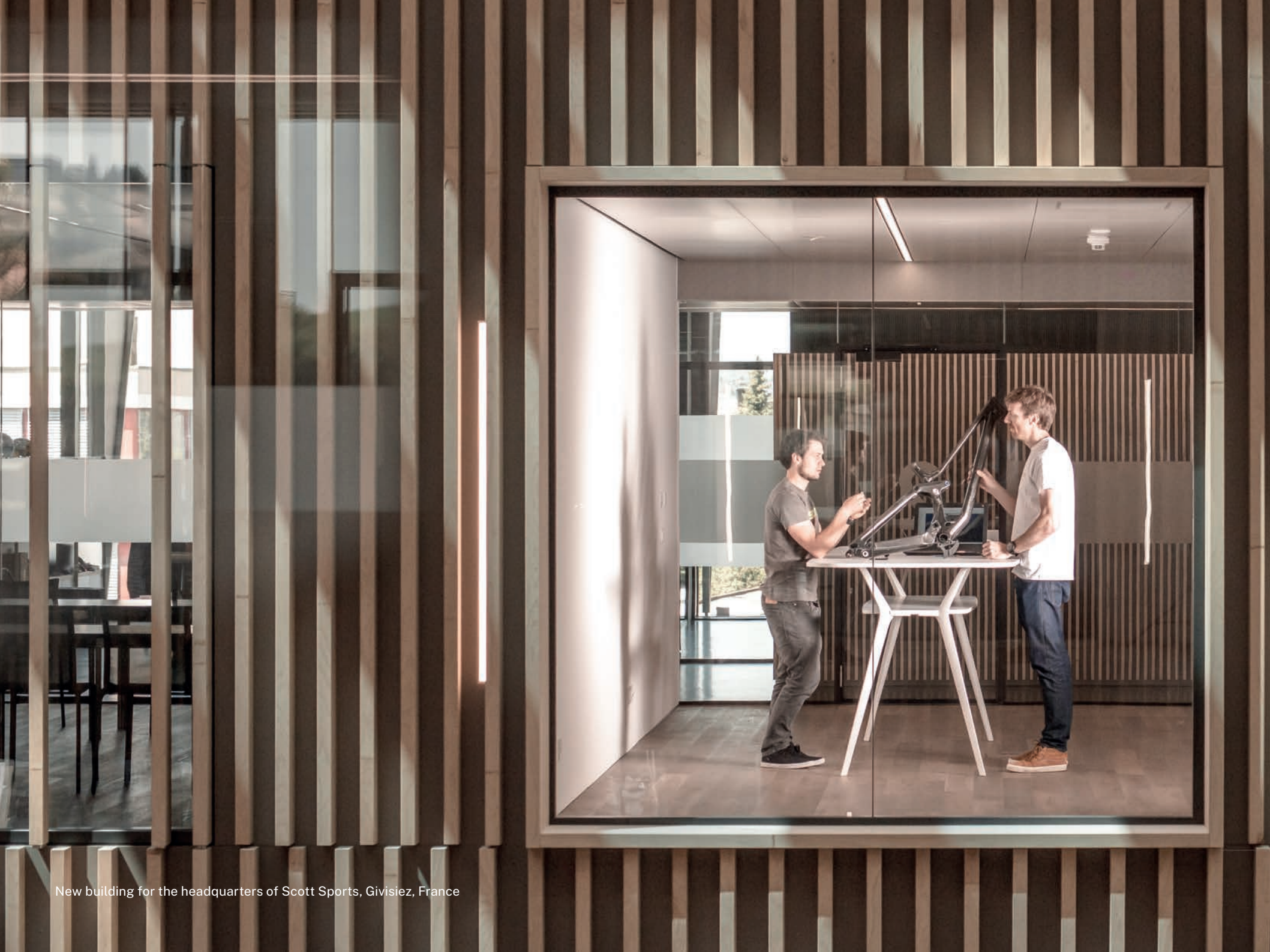
New building for the headquarters of Scott Sports, Givisiez, France